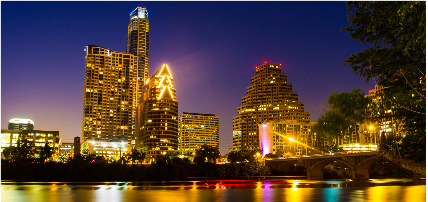
Austin City Lights.

SOUTHERN STATES COMMUNICATION ASSOCIATION