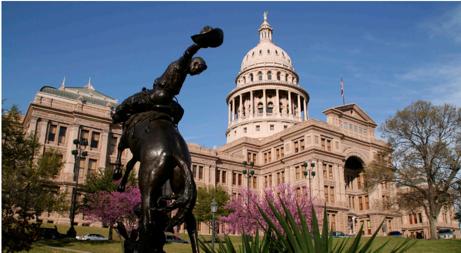
Texas State Capitol Building

ural pool. Austin also is home to some fantastic museums, including The Contemporary (just across the river), and the L.B.J. Presidential Library, the